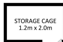
STORAGE CAGE 1.2m x 2.0m (NOT ACTUAL LOCATION)

INTERNAL FLOOR AREA 77m 2 BALCONY AREA 10.5m 2 STORAGE CAGE AREA 2.5m 2 TOTAL AREA 90m 2